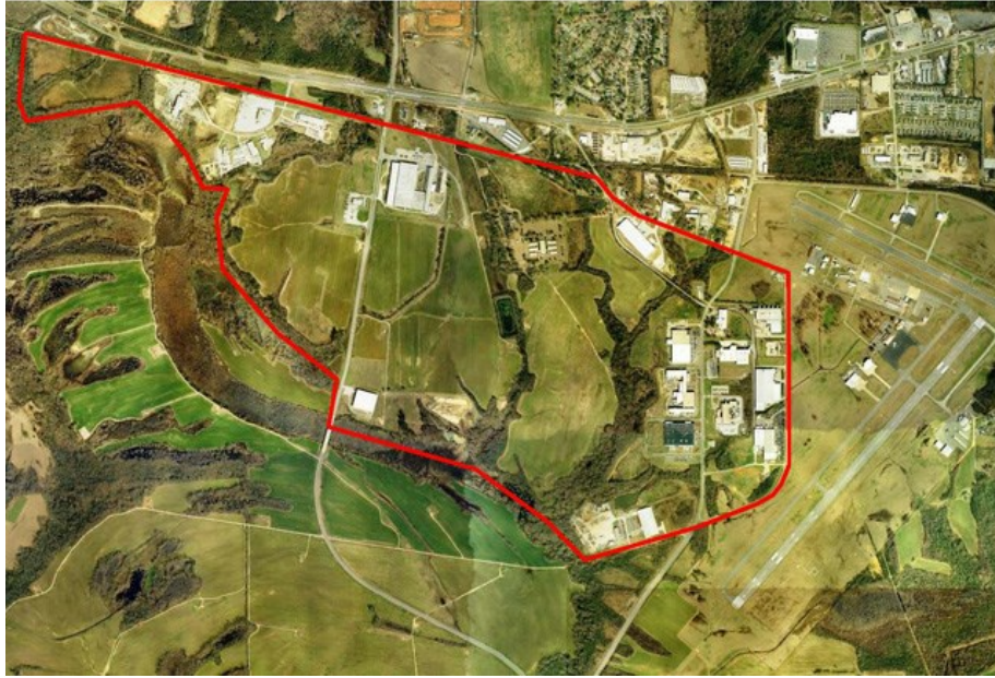
Robert Cardinal Road, Tuscaloosa, Tuscaloosa, AL, 35401